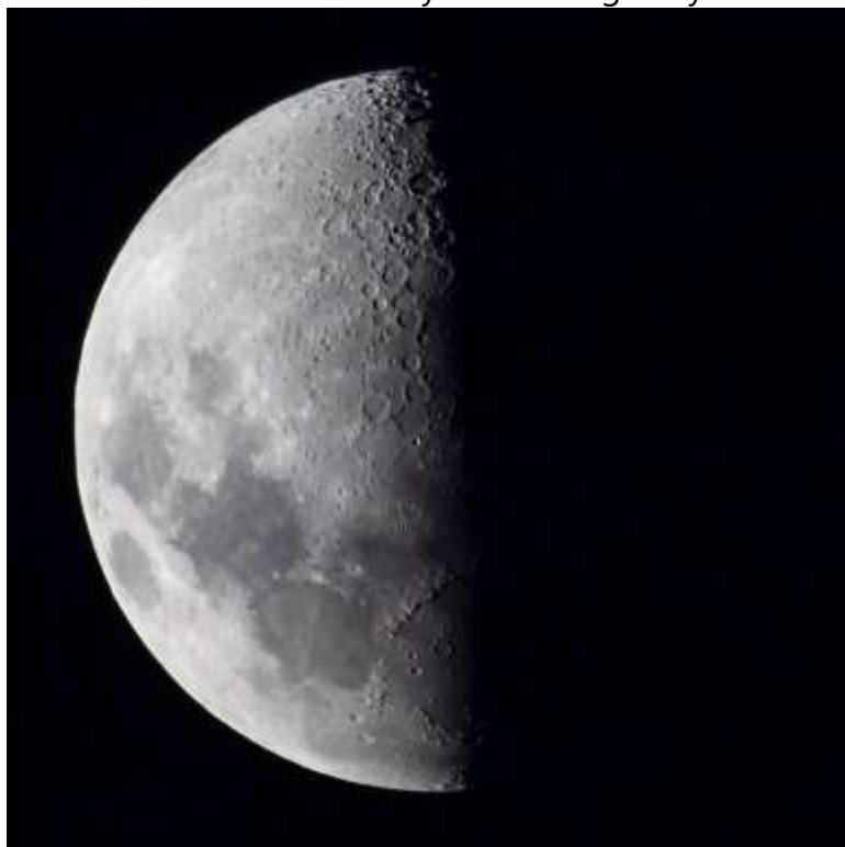
Moon Phase: First Quarter Moon

"I did not say these things to you from the beginning, because I was with you." – John 16:4b