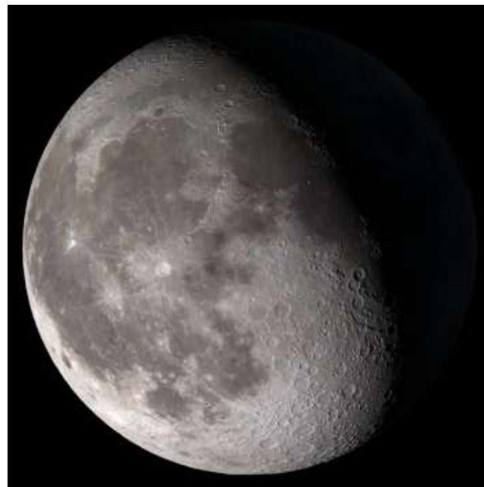
Moon Phase: Waning Gibbous Moon