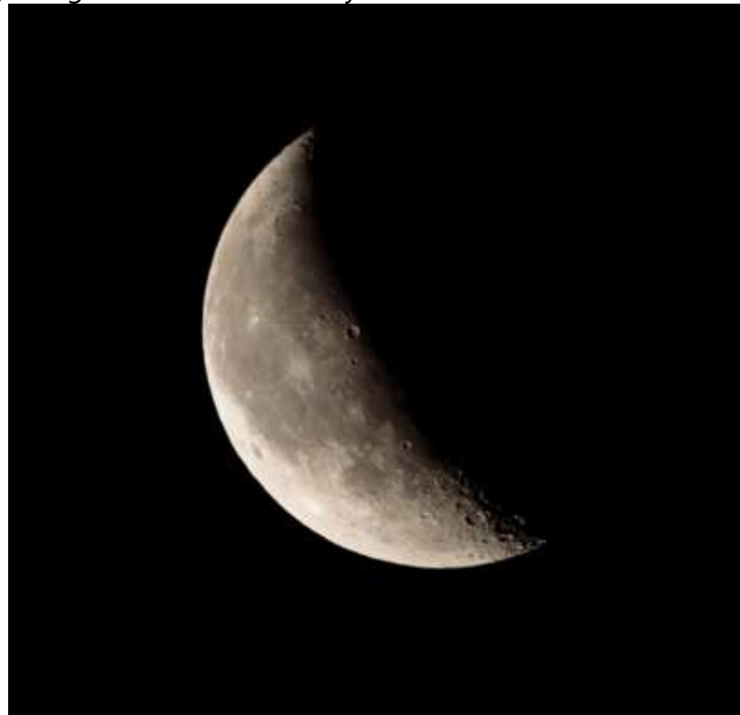
Moon Phase: Waning Crescent Moon