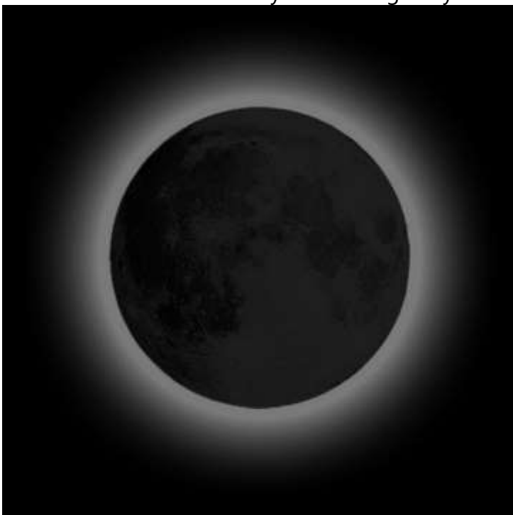
Moon Phase: New Moon

“I did not say these things to you from the beginning, because I was with you.” – John 16:4b