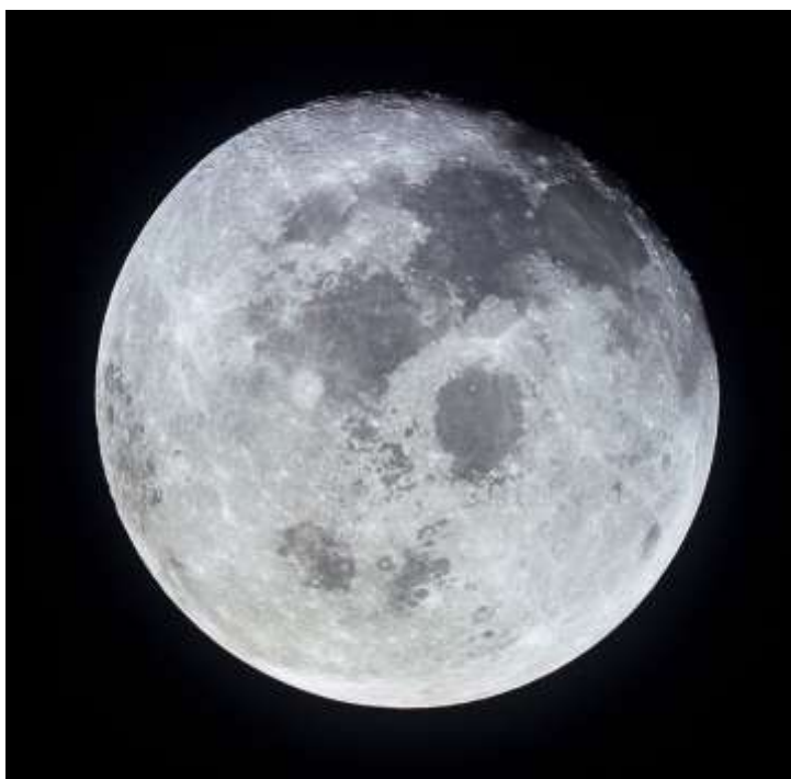
Moon Phase: Full Moon

“I did not say these things to you from the beginning, because I was with you.” – John 16:4b