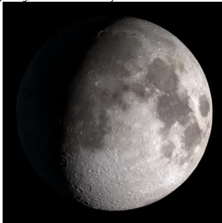
Moon Phase: Waxing Gibbous Moon