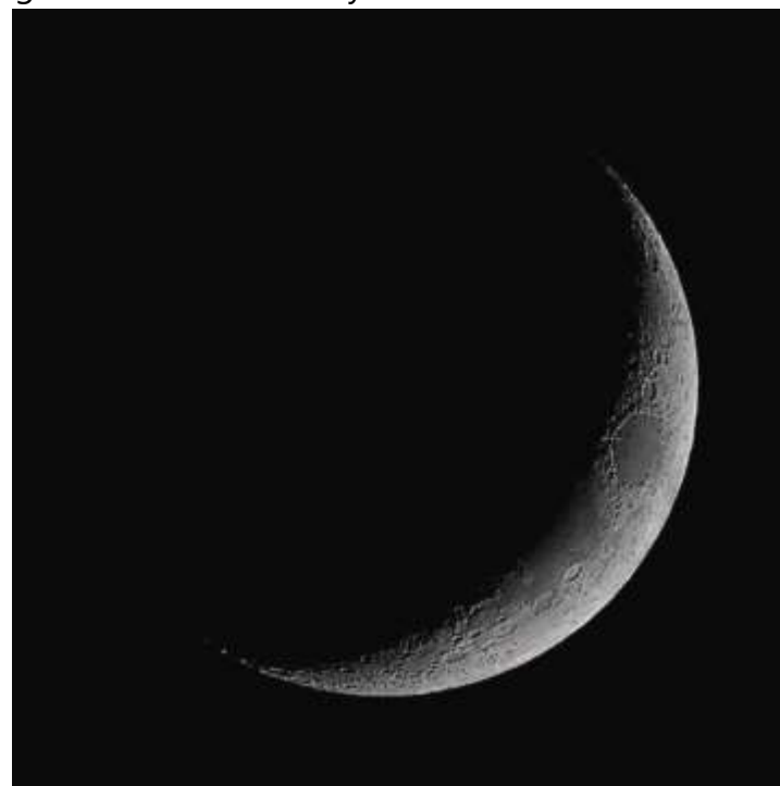
Moon Phase: Waxing Crescent Moon