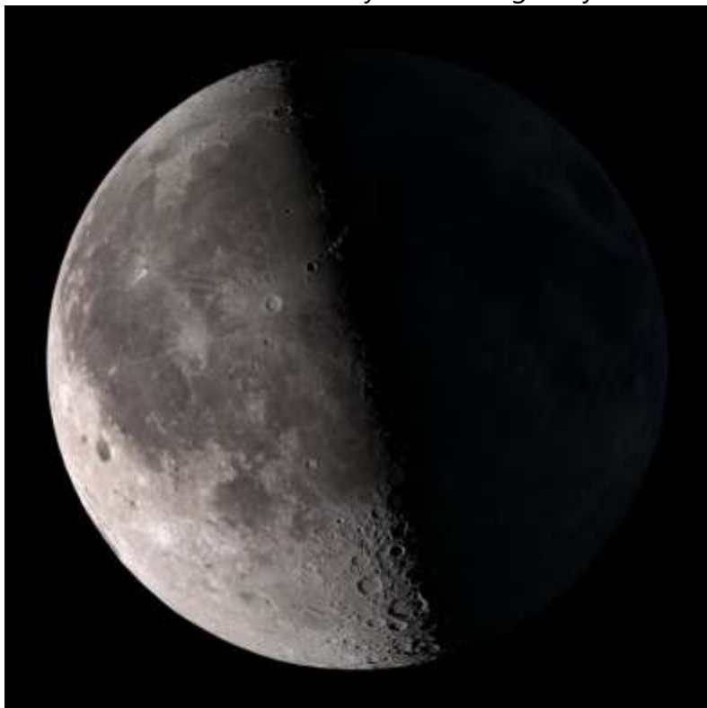
Moon Phase: Third Quarter Moon

“I did not say these things to you from the beginning, because I was with you.” – John 16:4b