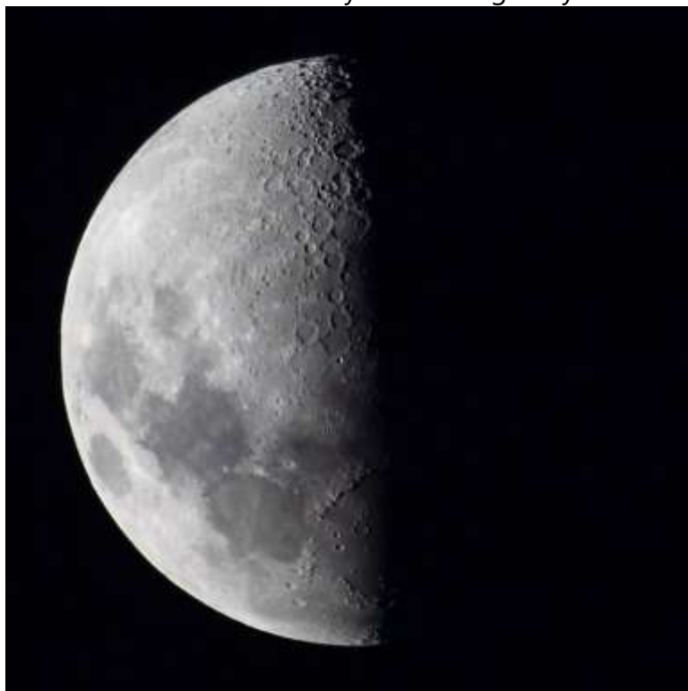
Moon Phase: First Quarter Moon

“I did not say these things to you from the beginning, because I was with you.” – John 16:4b