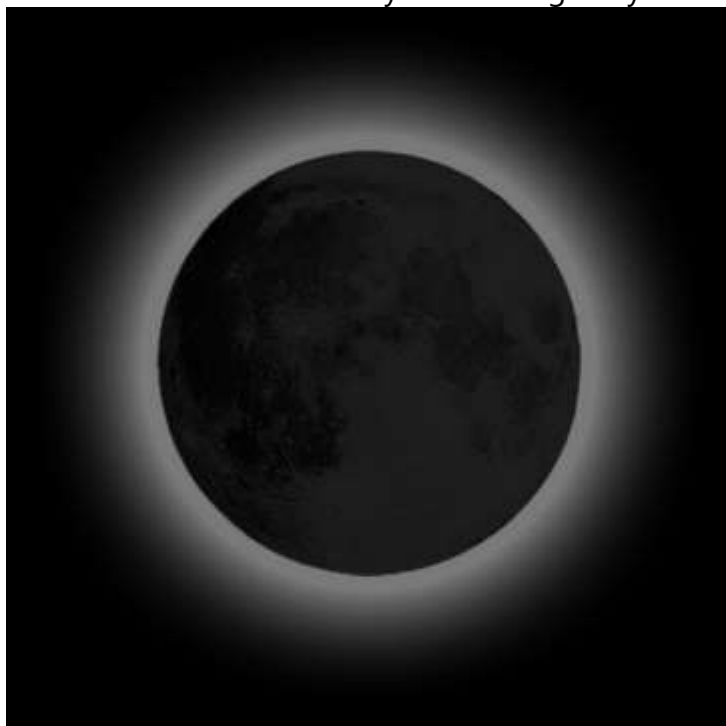
Moon Phase: New Moon

“I did not say these things to you from the beginning, because I was with you.” – John 16:4b