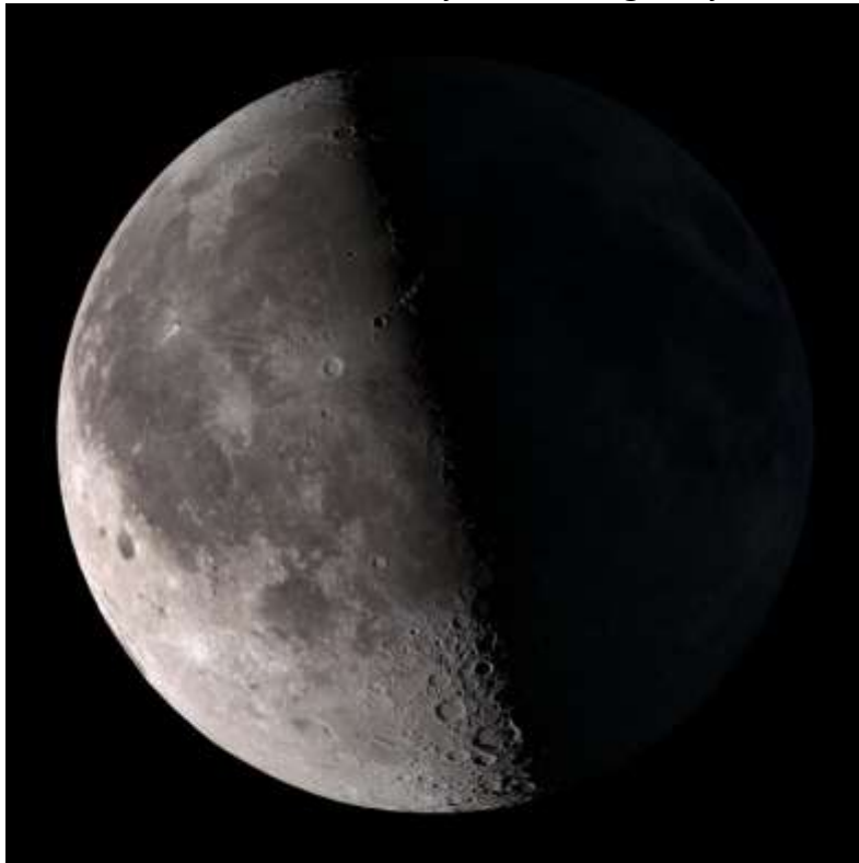
Moon Phase: Third Quarter Moon

“I did not say these things to you from the beginning, because I was with you.” – John 16:4b