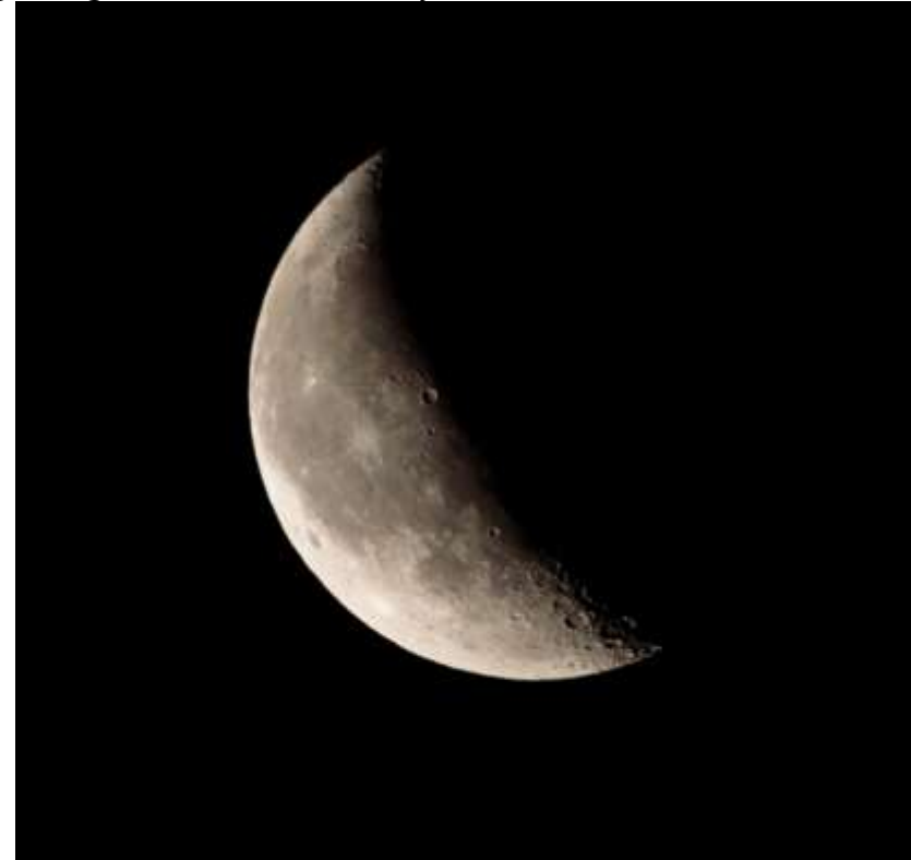
Moon Phase: Waning Crescent Moon