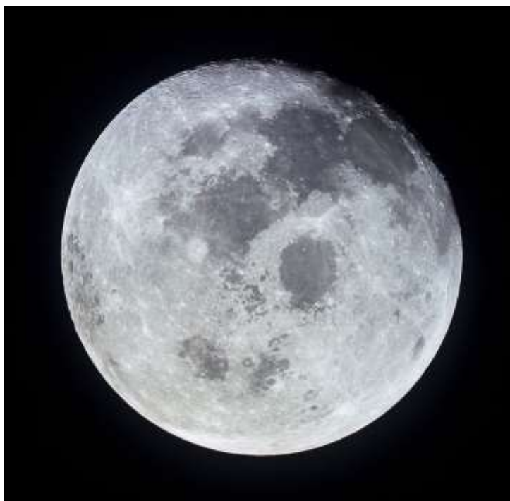
Moon Phase: Full Moon

“I did not say these things to you from the beginning, because I was with you.” – John 16:4b